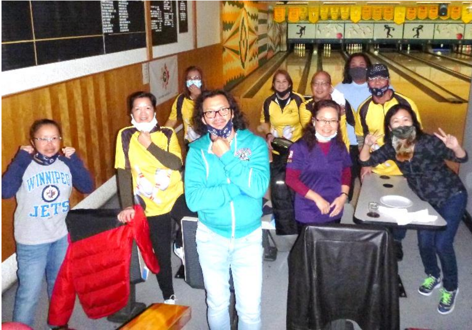
Some bowlers of the Mabuhay (Welcome To Everyone) Mixed League at Laverendrye enjoying the festivities.

The Bowler Appreciation Nights were held by the Winnipeg Tenpin Bowling Association (WTBA) and the Manitoba Bowling Association (MBA) to show their appreciation to bowlers that returned after being away from bowling because of Covid.